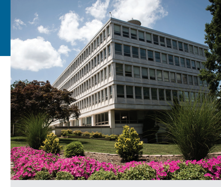
Administration Building, Raleigh, N.C.

The Leasing and Space Planning Section provides space planning, leasing services and assists with budgeting issues for state agencies that need to acquire or dispose of real property by lease. Leases include boat slips, airport hangars, research laboratories and warehouse and office space within North Carolina and around the world.