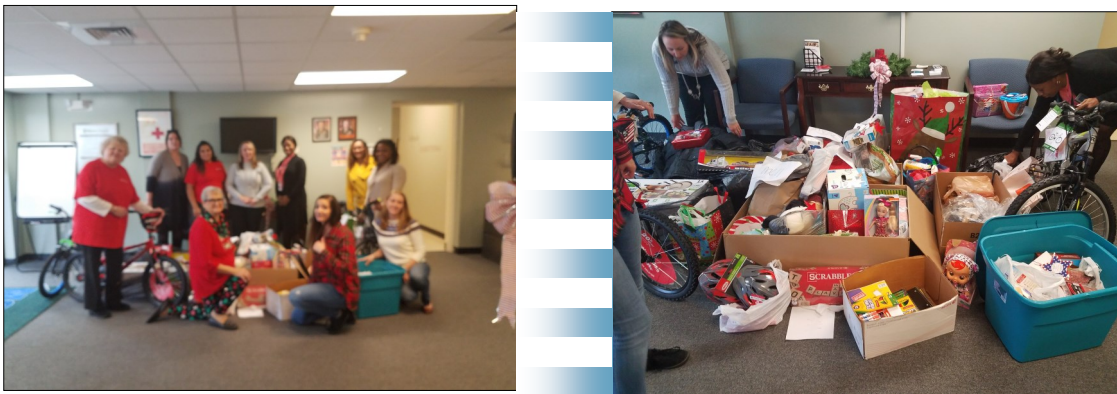
Veteran's Giving Tree Drop-off

Thank you again for your generosity and for making someone's day and future brighter!