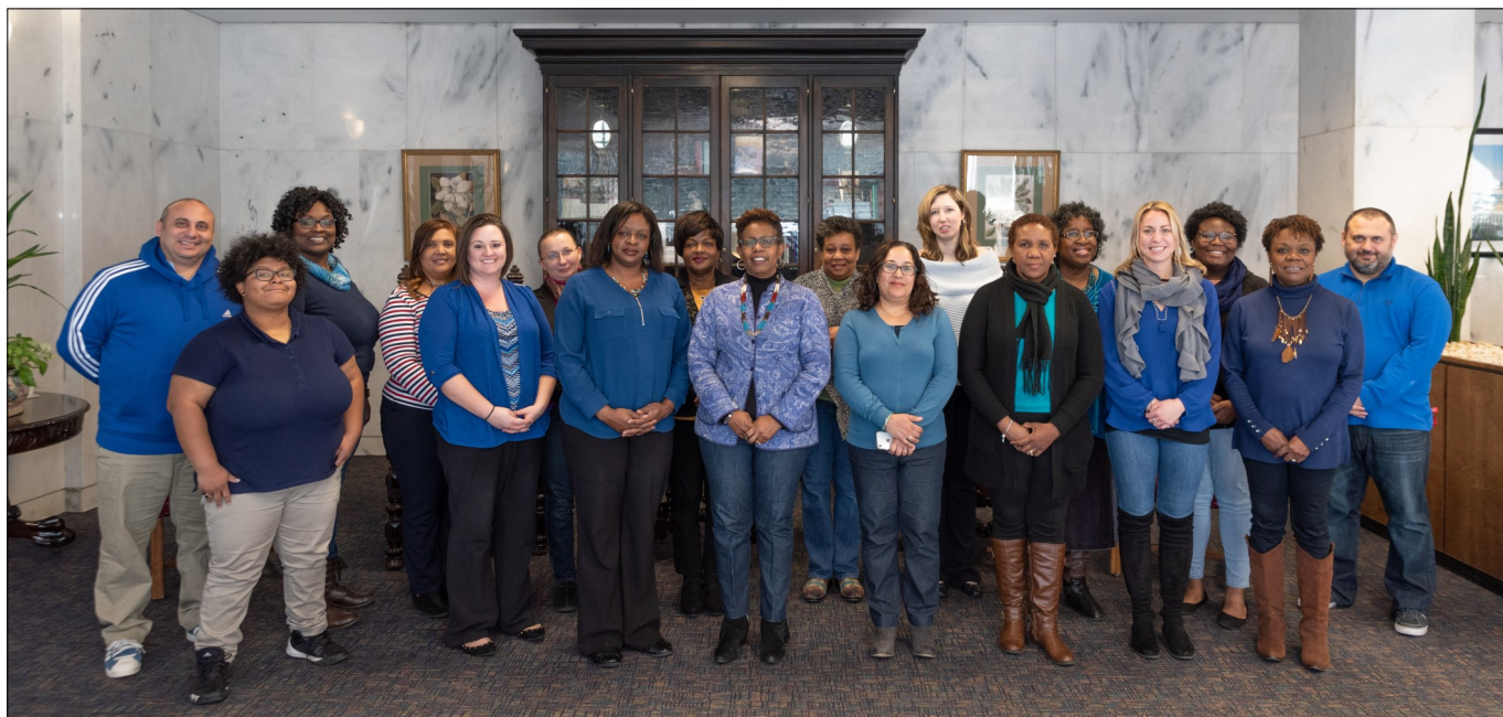
North Carolina Council for Women & Youth Involvement supporting #WearBlueDay on Human Trafficking Awareness Day, January 11, 2019