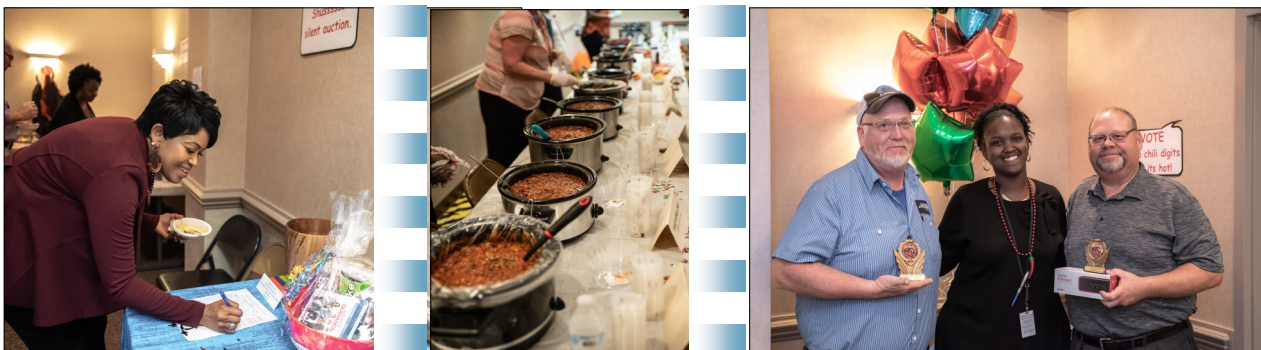
NCSECC Chili Cook-off Event and Silent Auction