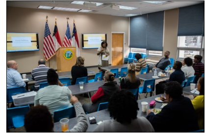
Lunch and learn event on Jan. 29

If you are interested in learning more about how human trafficking is affecting our state and nation, please visit the CFWYI Human Trafficking page and the National Human Trafficking Hotline website for further details.